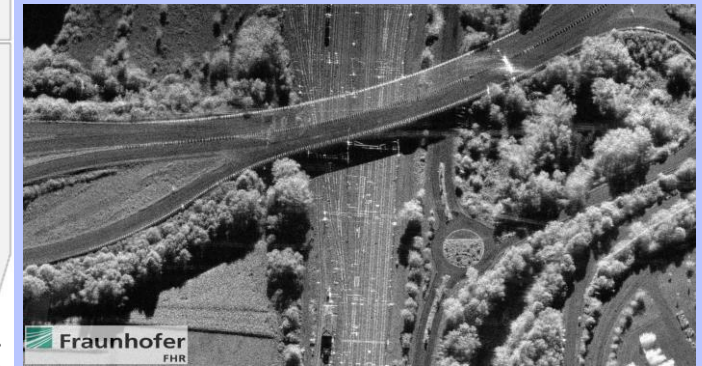
SAR Railway Infrastructure

For the IIMEO project, SAR and VIS sensors serve as the primary data sources. SAR sensors are capable of providing high-resolution data regardless of weather or time of day. The oblique VIS sensor is aligned with the SAR sensor with the intention to provide service users with more accessible data of sites of interest.